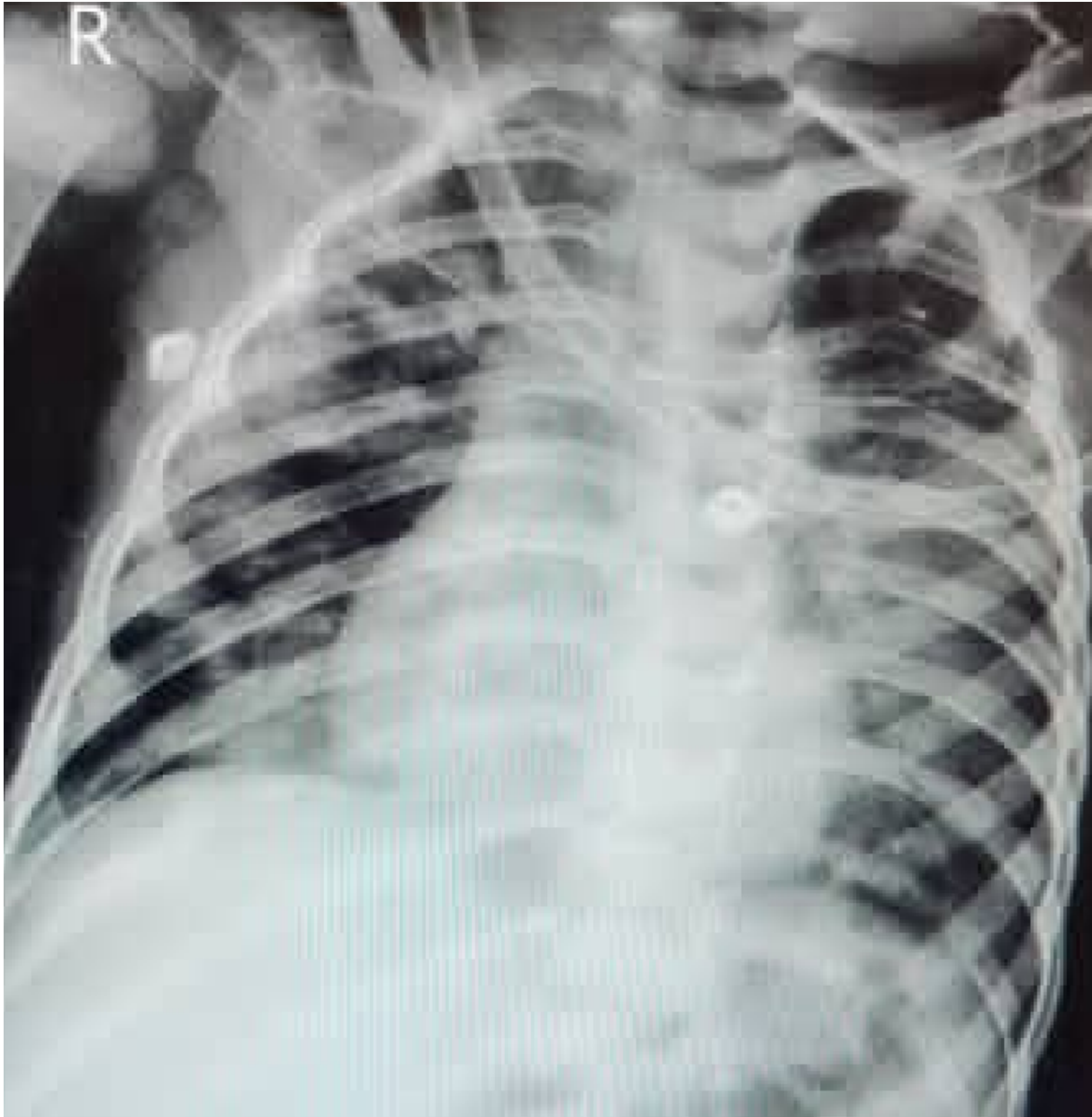
Figure 3. Third chest X-ray shows re-expansion of the lungs