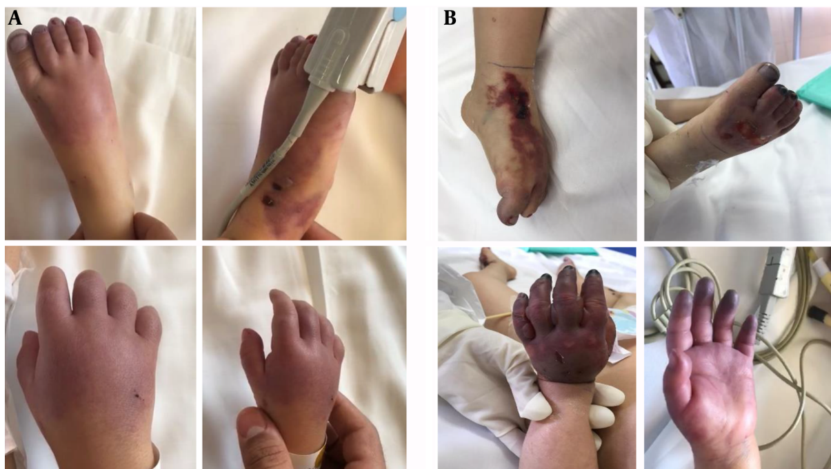
Figure 1. Presentation of PF of the patient: A, On admission; B, during her course of hospitalization

left ventricle and good biventricular function. On the second day after admission, a peripheral blood smear was taken, which showed leukopenia (lymphocyte dominant), hypochromic RBCs, moderate Burr cell count, a few acanthocytes, and severe thrombocytopenia as well as a few large platelets. Based on the pediatric hematologist and pediatric ICU specialists' recommendations, vasopressors and management of PF were started promptly. The patient was transferred to the pediatric ICU after a few hours.