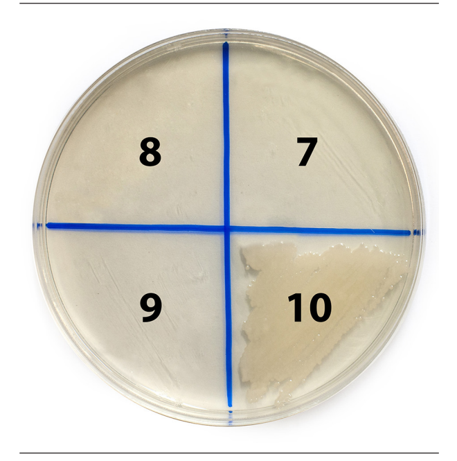
Figure 4. Minimum Fungicidal Concentration of Vi-one Mouthwash

The numbers are based on the numbers of the MIC tubes. The ninth zone indicated the minimum fungicidal concentrations of Vi-one mouthwash against C. albicans .