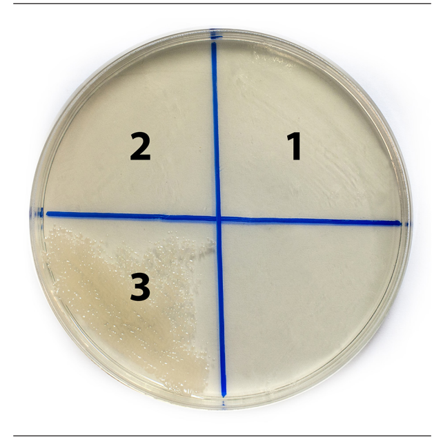
Figure 3. Minimum Fungicidal Concentration of Colgate Mouthwash

The numbers are based on the numbers of the MIC tubes. The second zone indicates the minimum fungicidal concentrations of Colgate mouthwash against C. albicans .