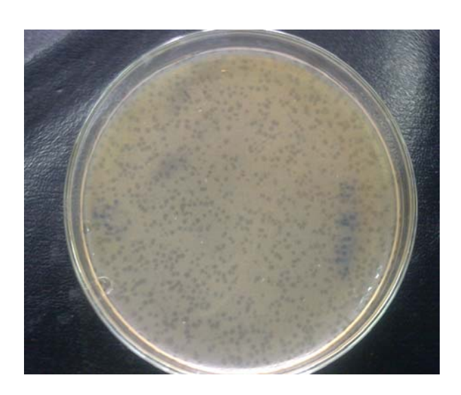
Figure 1. Bacteriophage TPR6 Plaques on E. coli M6

<sup>a</sup> Abbreviations: I, intermediate; R, resistant; S, sensitive.