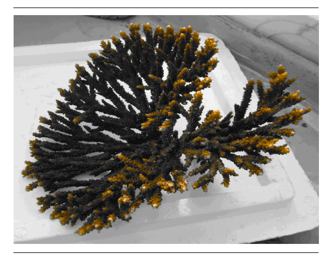
Figure 2. The Persian Gulf Coral, Acropora sp.