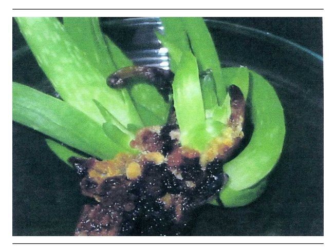
Figure 3. The Rooting of Proliferated Shoots in MS Medium Containing 0.5 mg/L NAA With a Callus Formed