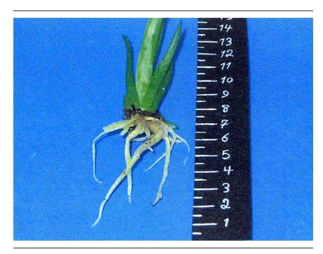
Figure 2. The Rooting of Proliferated Shoots in MS Medium Containing 0.5 mg/L IBA

<sup>a</sup> Values Followed by the Same Letter in Each Column Are Not Significantly Different (P < 0.05) Using DMRT