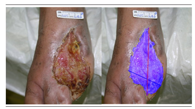
Figure 2. Patient 1, Five Weeks After Treatment With Trichloroacetic Acid