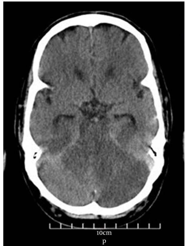
Figure 1. Unenhanced brain CT scan showing infarction in the occipital cortex bilaterally due to ischemic stroke involving the posterior cerebral artery.

The frequency of thrombotic events is high in patients with COVID-19 contamination that is associated with poorer outcomes. Common causes of acute bilateral vision loss include occipital infarction, traumas of the occipital lobe, migraine, occipital seizures, aggressive cardiac processes, and preeclampsia. Bilateral occipital infarct prompted by Stroke is a rare condition, and its diagnosis may be challenging due to unusual symptoms (6). Prompt diagnosis is very imperative in all kinds of ischemia. Among admitted COVID-19 patients, neurologic