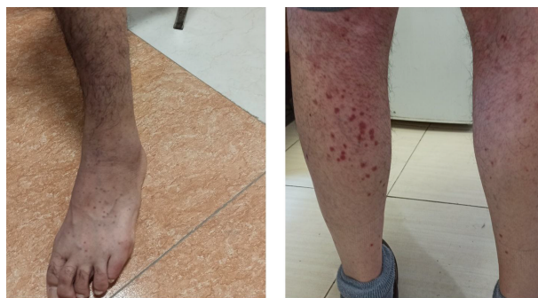
Figure 1. The palpable purpuric rash appeared on the back and lower extremities on the second week of admission

We started treatment with parenteral ceftriaxone and pantoprazole, oral azithromycin and lopinavir/ritonavir, and oxygen supplement. The pulmonary symptoms recovered gradually during the following days, but abdominal pain and malaise continued. We also asked for a nephrology consultation and complete abdominopelvic ultrasound for evaluating hematuria. The ultrasound study was unremarkable. Other laboratory tests showed a urine protein level of 565 mg in a day, negative results for the urine culture, anti-nuclear antibody, anti-double-stranded DNA, antineutrophil cytoplasmic antibodies, HBs antigen, HCV antibody, and HIV antibody. Also, D-Dimer, prothrombin and partial thromboplastin times, peripheral blood smear, and the serum complements were normal. In the second week of admission, a palpable purpuric rash appeared on his back and lower extremities and extended in two days (Figure 1). Upon consultation with a dermatologist and rheumatologist, we performed a skin punch biopsy and started intravenous dexamethasone 4 mg three times a day, which improved his condition in the following days. The histopathology study revealed superficial lymphocytic infiltrate and small-vessel vasculitis in the dermis (Figure 2). We diagnosed HSP based on clinical presentations and histopathological findings. Finally, we discharged him on day 18 of admission without any vital organs damage with oral prednisolone and ferrous sulfate supplement. The purpuric rashes disappeared after two weeks.